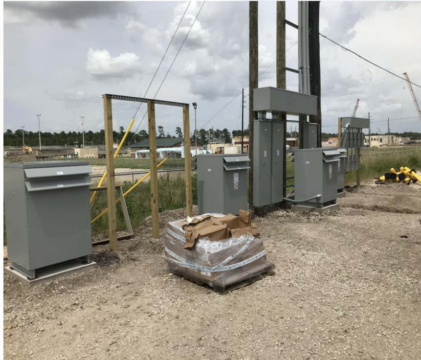
T-LA & T-LA1 and Disconnects