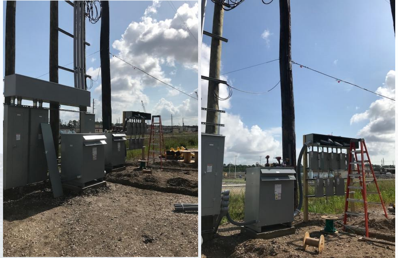
Added Transformer T-LB1 and Disconnects