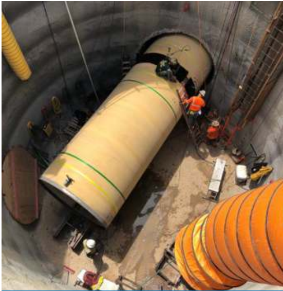
Welding and Wrapping Joints for Tunnel Carrier Pipe