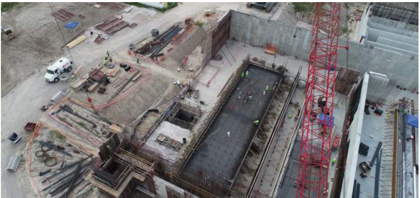
Central Plant East Side Work Area

\\wob-loc1\Datadata\Client\4-Houston\NEWPP\MonthlyProjectReports\newpp08192019-08_NEWPPProjectReports\beside\inclnd