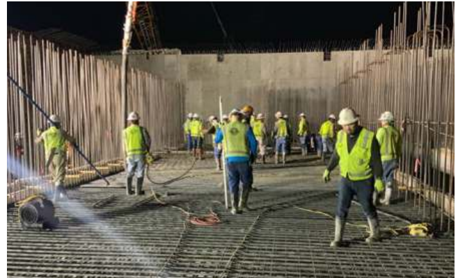
Filter 12 Slab Pour