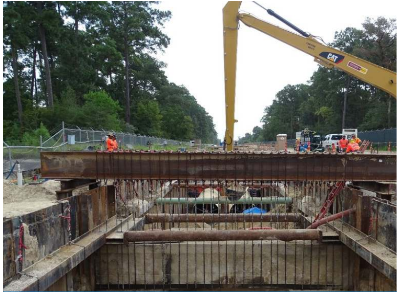
Braced Existing Box Culverts and Excavating Around Them