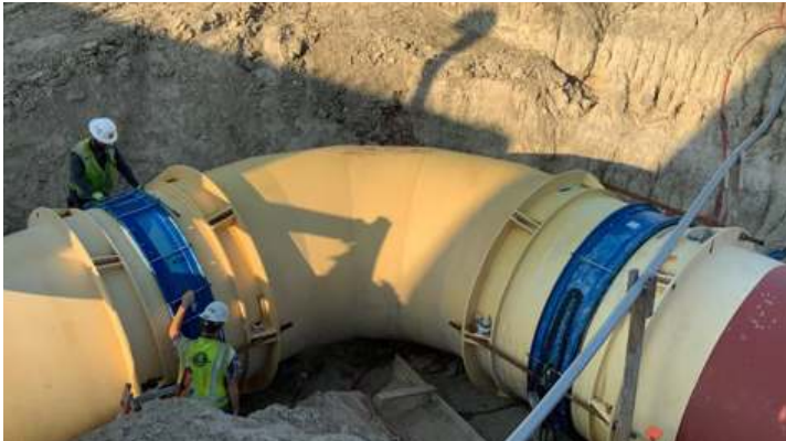
Central Plant Flex-Coupling Installation on 84" CFE to TPS