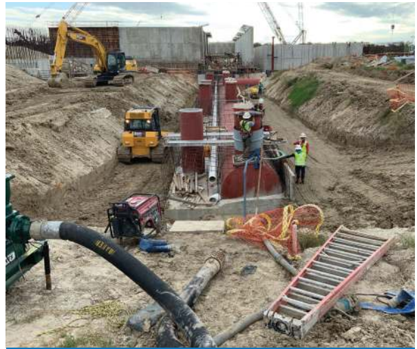
281-FILTER MODULE- Pipe Encasement/Backfilling