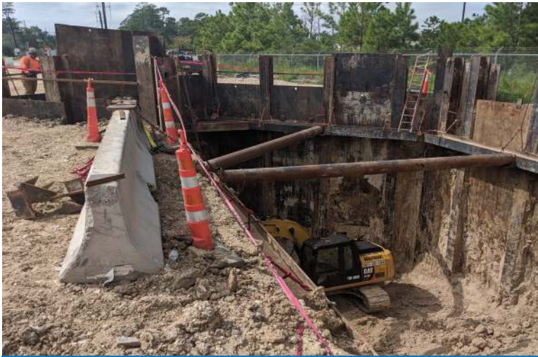
Tunnel 2.0 Portal Excavation sta 134+50