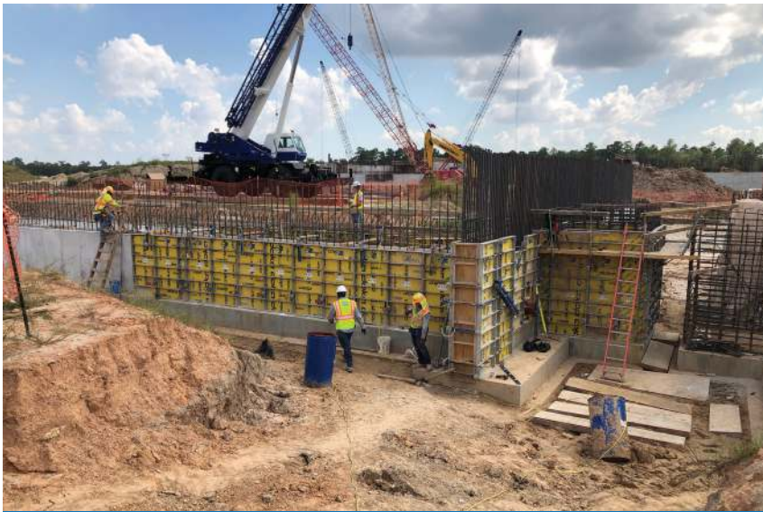
Facility 242 Cross Collector and Stem Walls F/R/P/S