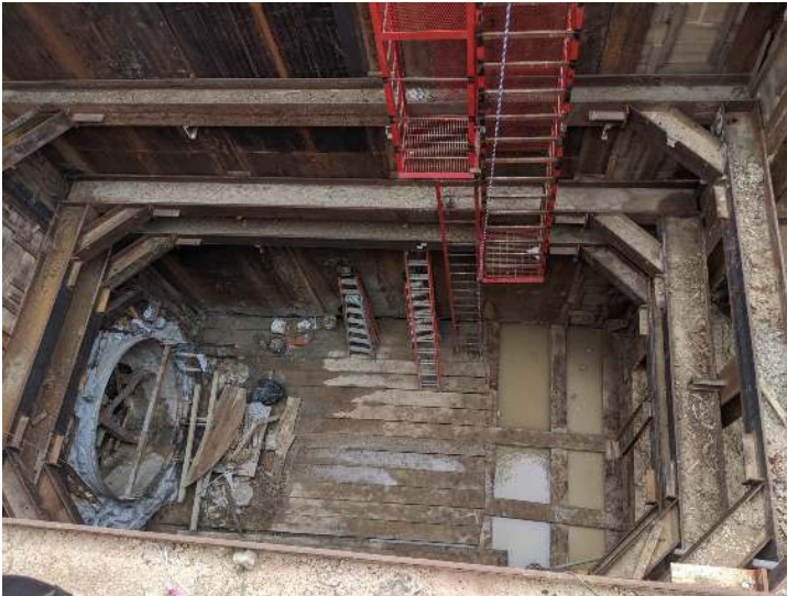
Station 128+50 Tunnel Portal Shoring