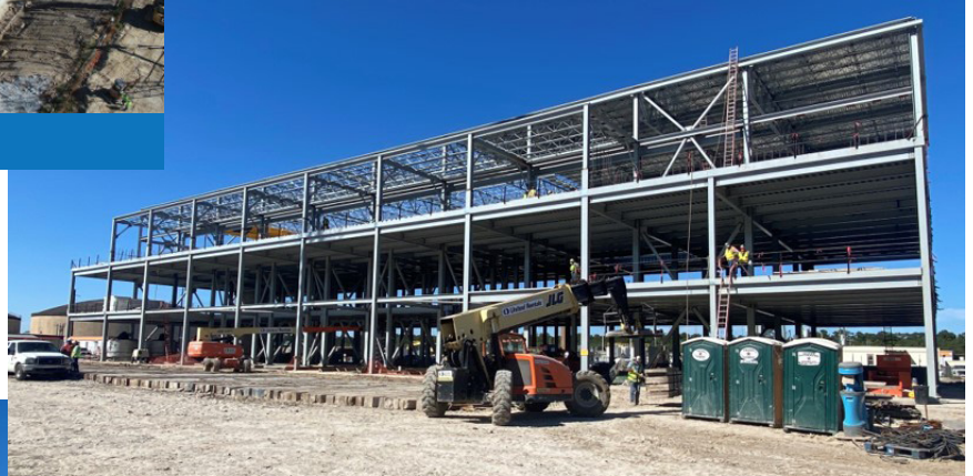
Dewatering Building 520