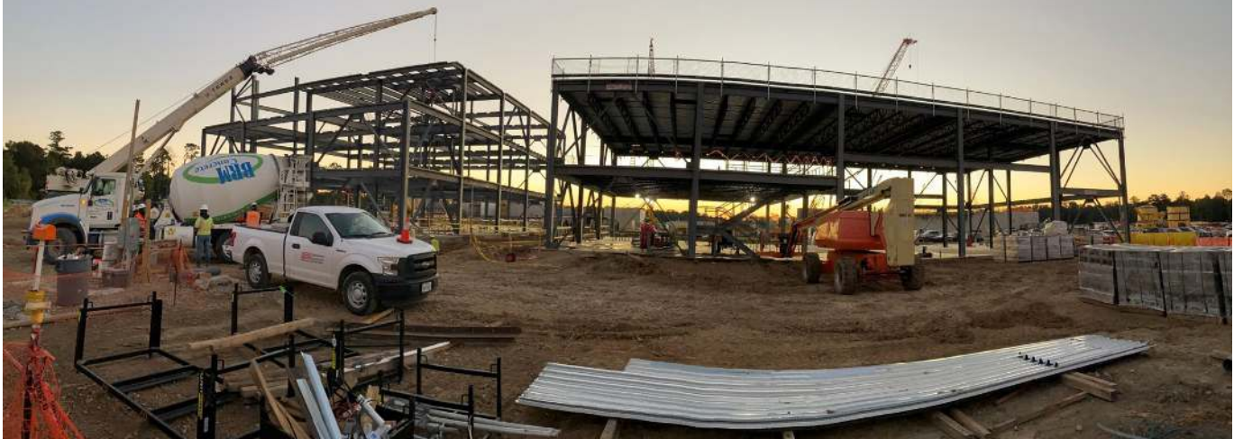
Administration and Maintenance Building