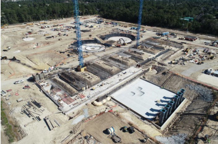
Central Plant – Phase 2