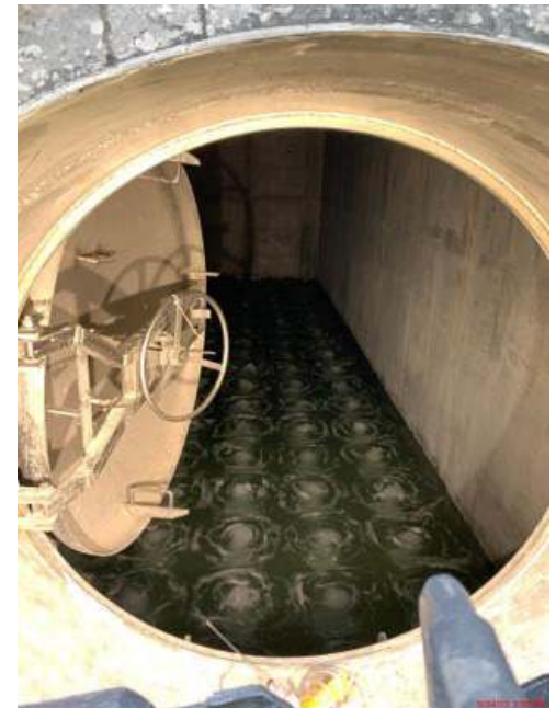
252-Ozone Contactor 2: Diffuser Bubble Test