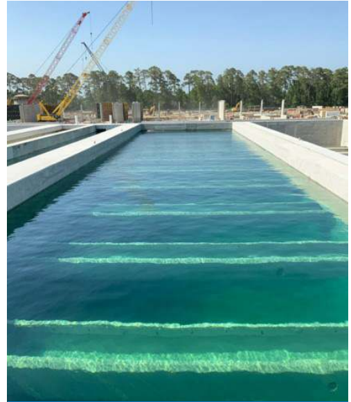
Facility 282- Leak Test