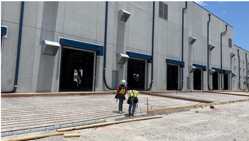
Rebar Install Facility 520 Driveway

V:\Client\4\Houston\NEWPP\MonthlyProjectReports\newpp0522\2022-May_NEWPPProjectReport.indd