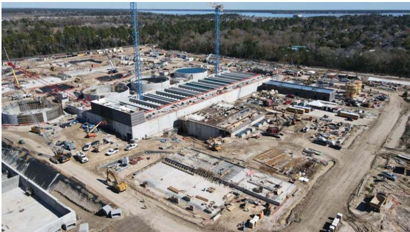
Central Plant - Phase 2