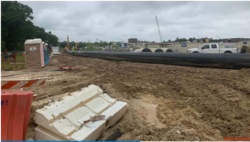
42-inch Temp Commissioning Pipeline